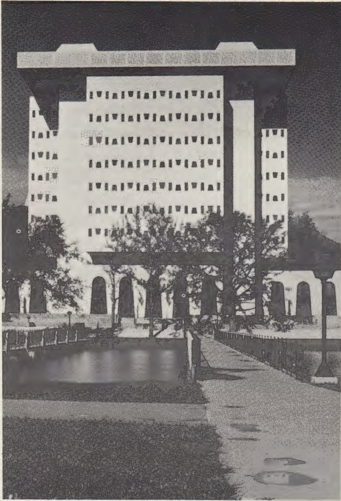
Library Administration Building