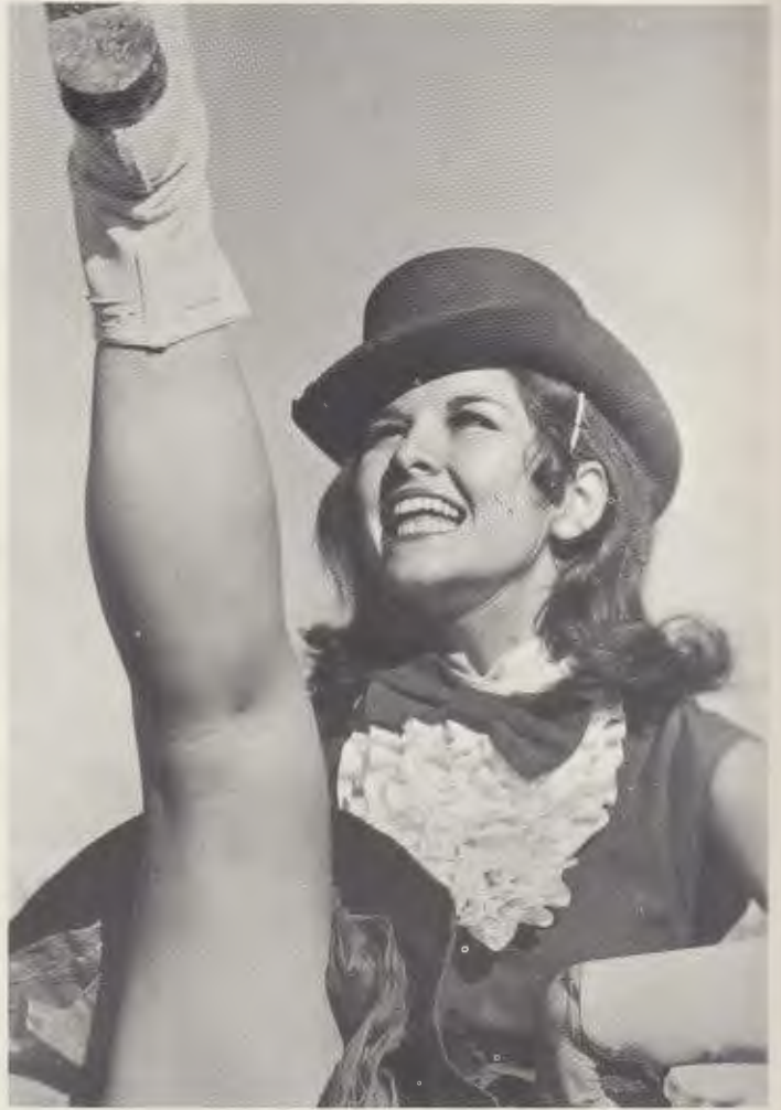
Strutter trademark — high kicks & flashing smiles