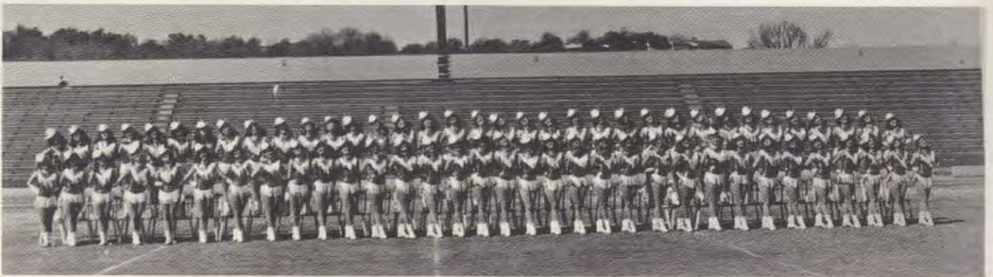
Southwest Texas State University Strutters