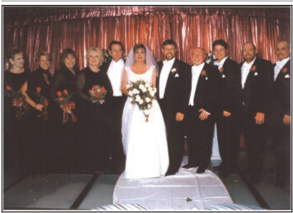
The Wedding Party