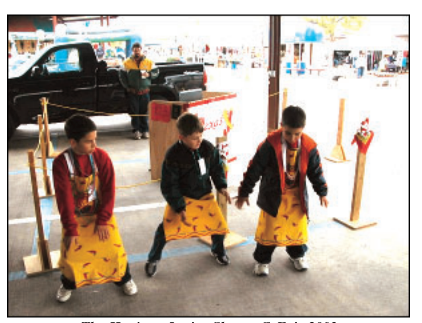
The Hotties - Junior Show - CyFair 2003