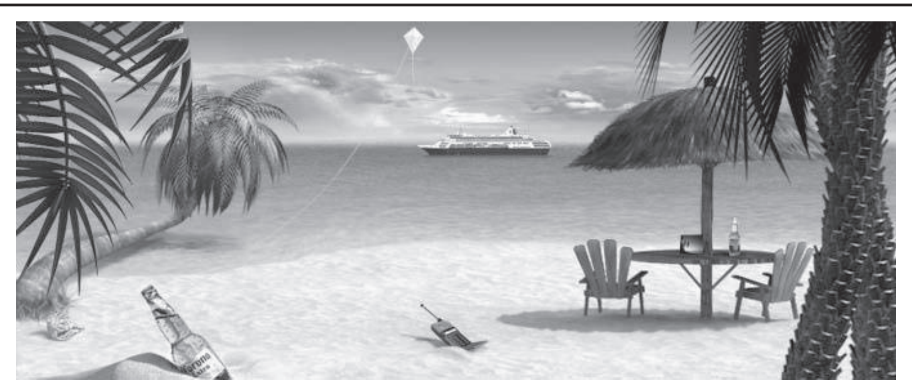
Corona and Glazer's Distributors Proud Sponsors of CASI