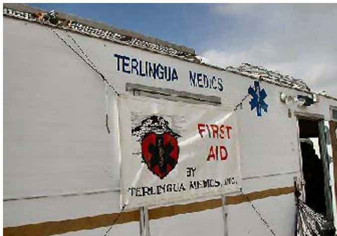
The old Terlingua Medics facility