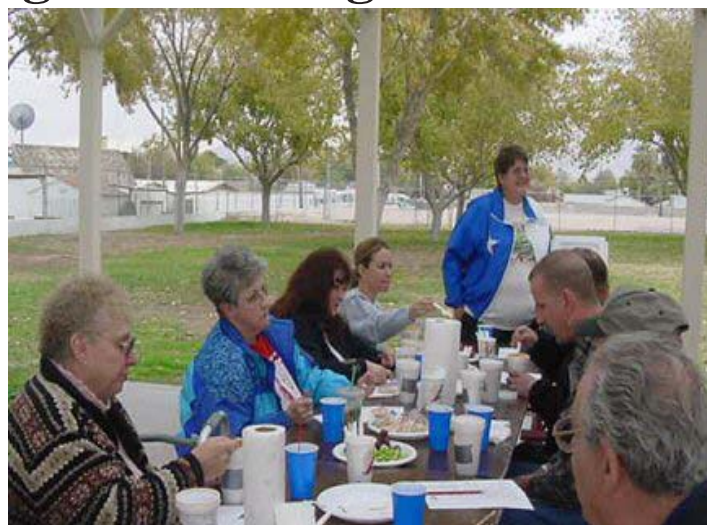
Judging Final Table at CIN Pod Cookoff

Fifteen cooks, most from Texas, gathered at the Fraternal Order of Eagles hall in Las Vegas, Nevada.