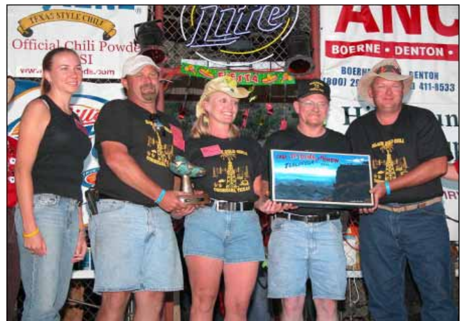
1st Place Small Show--BLACK GOLD CHILI