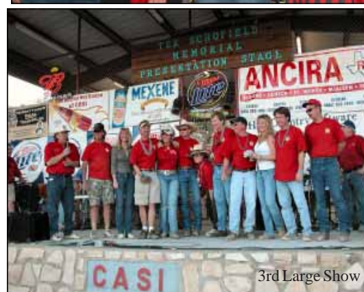
3rd Large Show

Oct 16, 2004-008 - Eden NC CASI Chili Chow Down, 19 CHILIS