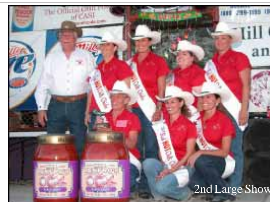
2nd Large Show