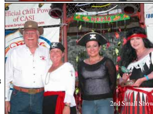
2nd Small Show