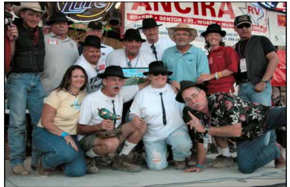
1st Place Large Show--BOOZE BROTHERS