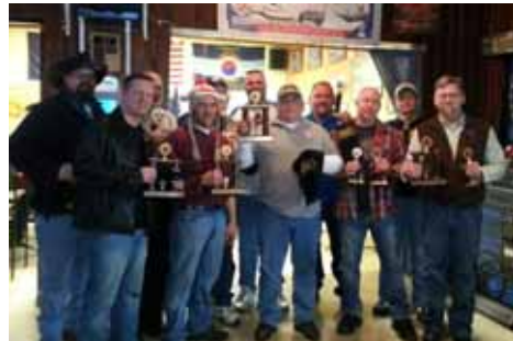
Kansas Men’s State Winners