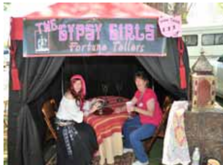
Gypsy Girls- 1 st Place Show TLS CCO