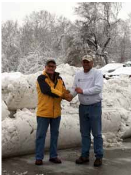
Left – Check Presentation to the VFW in Late March Snow