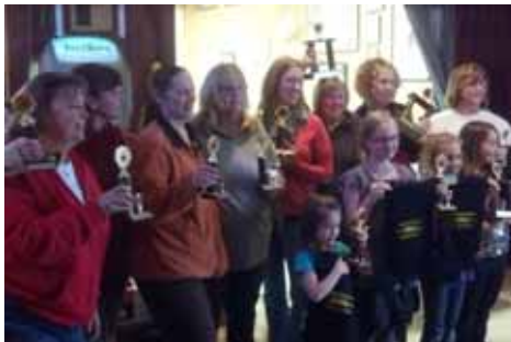
Kansas Women’s State Winners

CASI cooks and judges and hosts are the greatest! We look forward to seeing you at a Kansas Cookoff soon.