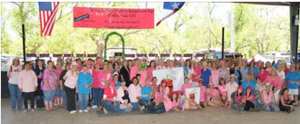
Texas Ladies State Divas Photo